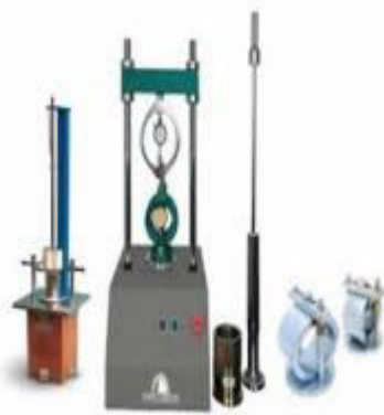
Marshall Test Machine

APPARATUS: Marshall stability test machine, hammer, cylindrical moulds, hanger with weight, compaction pedestal, Set of sieves (19, 13.2, 9.5, 4.5, 2.36, 1.18, 0.6, 0.3, 0.15, 0.075)mm, water bath, VG 30 bituminous grade